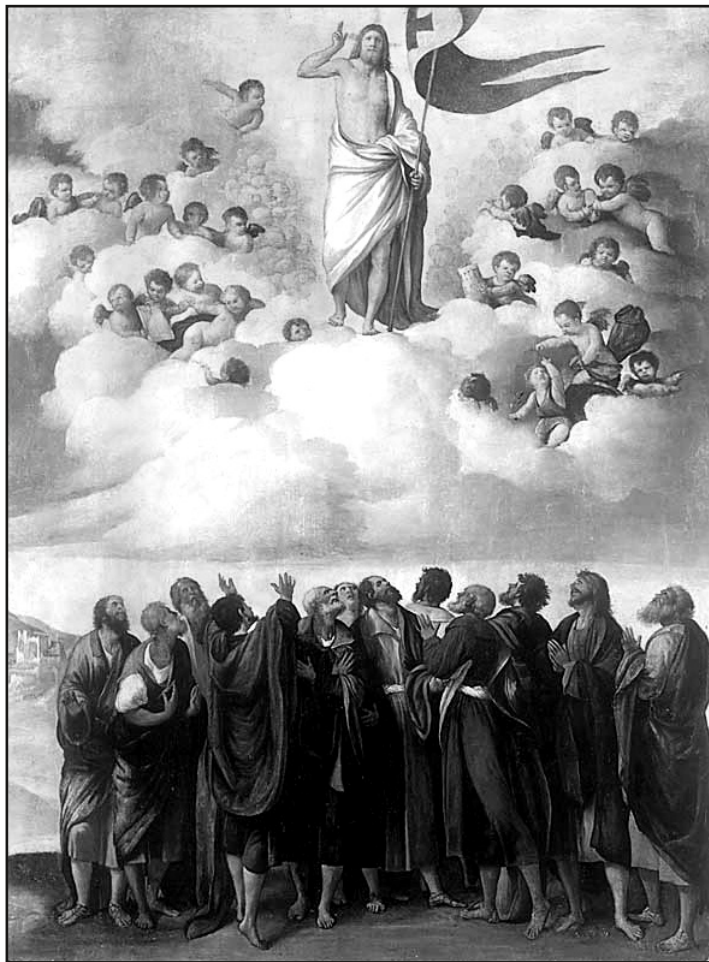
the Ascension by Dosso Dossi, 16th Century