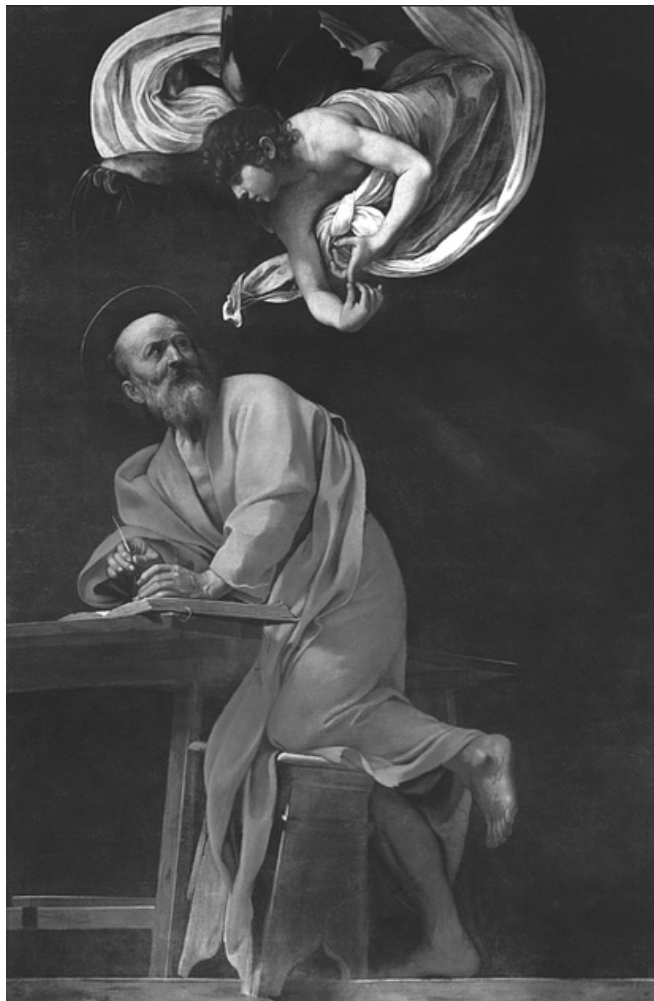
St Matthew instructed by an Angel (Caravaggio)